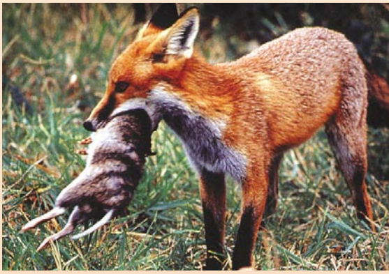
Foxes are one of the most widely distributed feral animals in Australia and can be found in most habitats, except in the tropical regions of the far north. They prey on a wide variety of small animals.

Fencing and broadscale fox control with poison baits has been used successfully in Western Australia, allowing populations of some native mammals to begin to recover and return to former habitats. Similar control activities have been undertaken in eastern Australia. Such control can ease the pressure on populations of native animals, but it is expensive and must be maintained indefinitely.