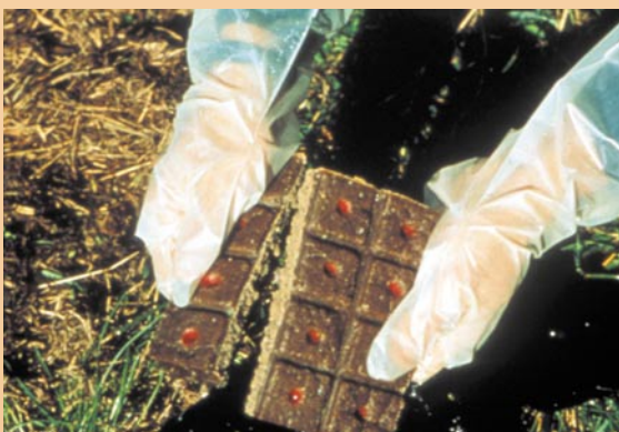
Foxes can be poisoned using baited meat, or specially prepared baits like the one shown here. Baits are often buried to reduce the chance of them being taken by native animals.

Foxes are less common where dingos are present, and this may be another form of biological control. Researchers are looking at the interactions between foxes, dingos and feral cats; their findings could help in integrating fox and feral cat control.