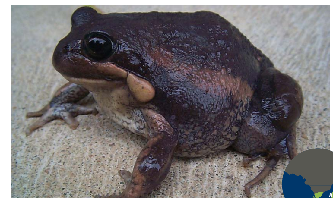
Eastern Banjo Frog Limnodynastes dumerilli

The Eastern Banjo Frog is a common inhabitant of wetlands and rivers. During dry periods it spends its time in a burrow. The body is rough and warty, varying from a pale grey to dark brown or black. The sides are commonly marked with bronze, purple or black. Size - Males 52-70 mm, Females 52-83 mm. Habitat - Burrows in loamy soils and emerges to feed and breed after rains.