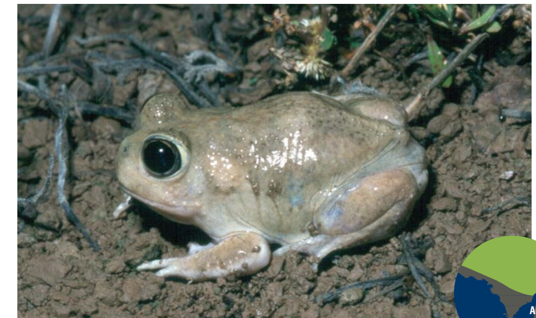
Trilling Frog Neobatrachus centralis

The Trilling Frog is easily confused with other burrowing frogs. It is characterised by a high and broad head. Its colour is mostly sandy-grey to brown with irregular dark and light markings. The limbs are short, the toes are cylindrical and extensively webbed, while the fingers have no webbing. Size - Males 41-50 mm, Females 41-55 mm. Habitat - Found in South Australia's arid regions, especially in areas with clay soils near woodland and Triodia (spinifex or porcupine grass) covered sandhills.