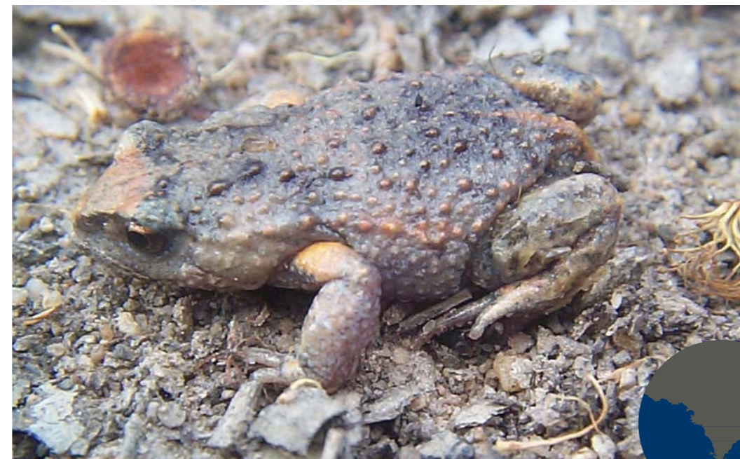
Bibron's Toadlet Pseudophryne bibroni

Although the most abundant and widespread of its genus, Bibron's Toadlet is believed to have become less abundant in recent times. Bibron's Toadlet is brown to almost black above with a scattering of darker flecks and reddish spots. The frog's belly is marbled with black and white. Its skin can be smooth or granular and is usually scattered with a few warts. Size - Males 22-30 mm, Females 25-32 mm. Habitat - Found in damp areas with some cover such as logs and stones.