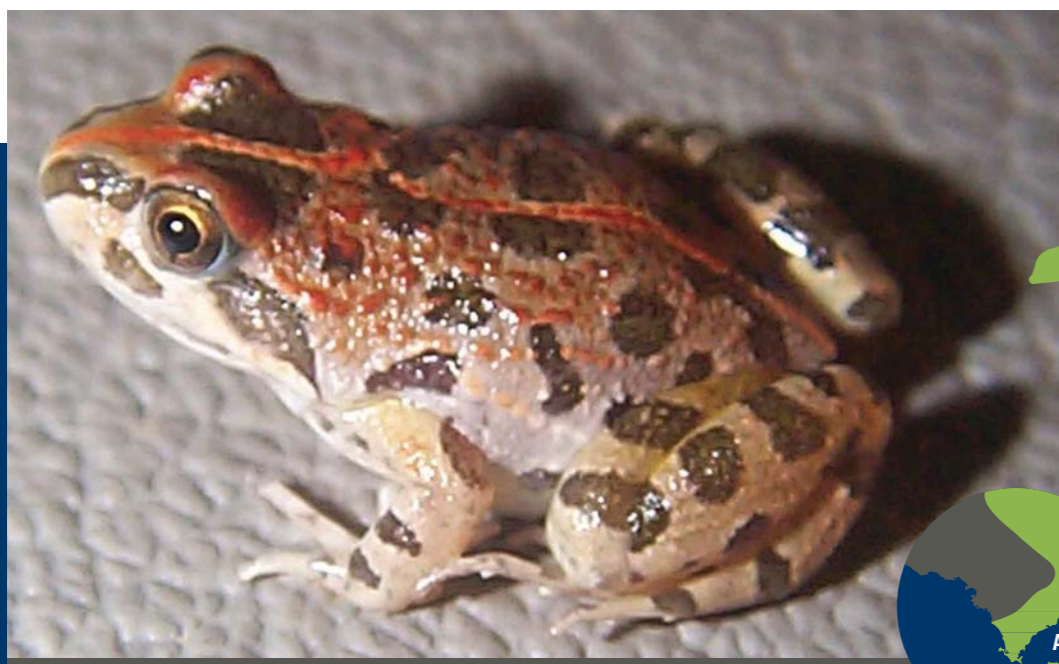
Spotted Grass Frog Limnodynastes tasmaniensis

The Spotted Grass Frog is the most common frog in Australia. It is characterised by olive-green or brown spots on a pale greyish-brown background, which may change over the course of the day, being particularly pale at night. Breeding males have a dark yellow-green throat. Size - Males 31-42 mm, Females 32-47 mm. Habitat - A widespread species. Habitat includes marshy country, creek edges and wetlands.