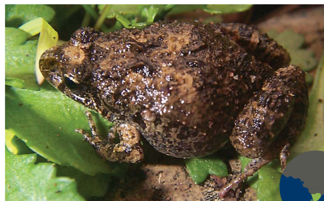
Common Froglet Crinia signifera

The Common Froglet has highly variable skin colour and texture, even within populations. The skin may be plain, striped or spotted, smooth, warty or rigid. The belly is usually white with black splotches. Size - Males 18-25 mm, Females 19-28 mm. Habitat - Found beneath rocks, vegetation and debris at the edge of creeks, ponds, wetlands and areas of seepage. During dry periods the frog may be found away from water sources.