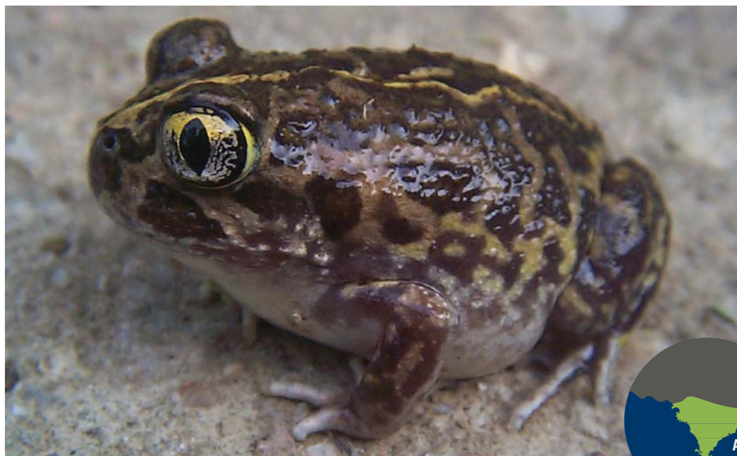
Painted Frog Neobatrachus pictus

Photos and text courtesy of the Environmental Protection Authority