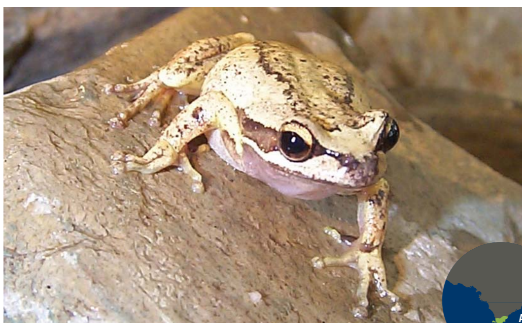
Brown Tree Frog Litoria ewingi

The Brown Tree Frog is slender and medium sized with a broad head and rounded snout. There is a narrow black or brown stripe from the snout to the shoulder and a pale stripe beneath the eye. The back of the thighs are yellow-orange and sometimes have small black spots. Size - Males 22-40 mm, Females 32-46 mm. Habitat - Occupies a wide variety of habitats in South Australia. It can be found on the ground, in vegetation, under rocks near permanent streams or pools, and in your garden.