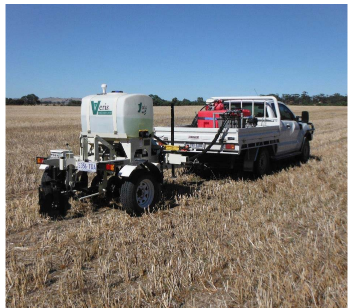
Image 1: Soil sampling was conducted using a Veris 'on-the-go' machine.

The maps also provided a prompt for landholders to plan and undertake relevant management strategies, including clay spreading or liming. Those with variable rate capabilities could also use pH maps to target lime applications based on paddock zones, thereby saving on lime purchase and application costs.