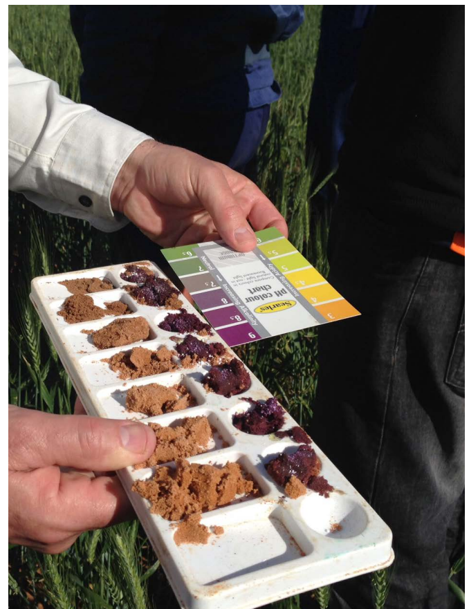
Image 3: Regular soil testing is critical to monitor changes in pH.